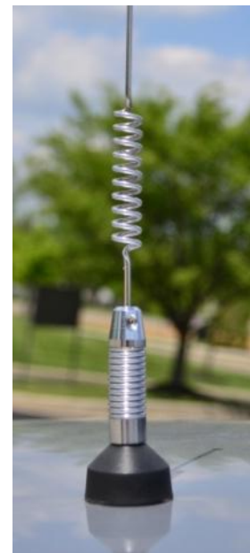
The new mobile antenna model