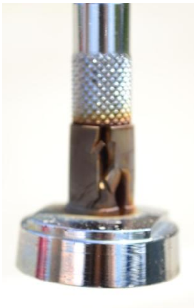
Plastic DUELIST can dry out and split, metal will rust on your mobile antenna