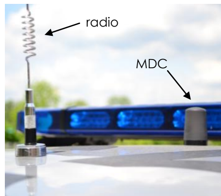
Top of vehicles should have a short black MDC antenna & pig-tail radio antenna, NOT 2 pig-tail antennas.