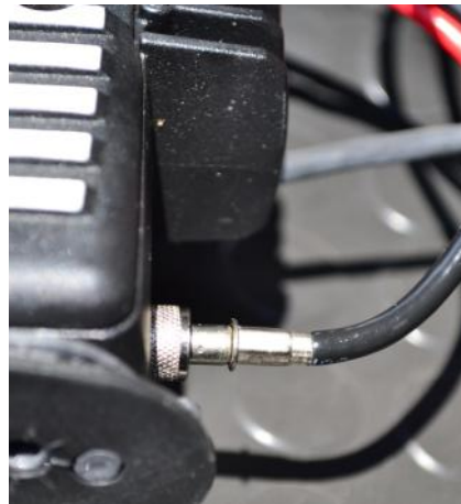
Coax cable into the back of your radio (in trunk) should be hand-tight.