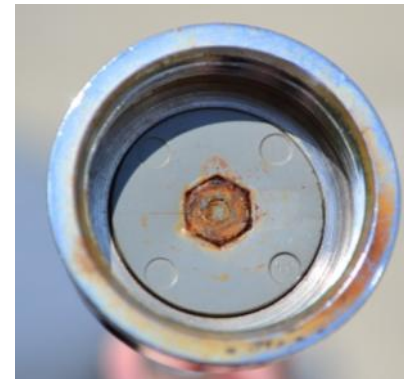
Unscrew antenna from vehicle & inspect the underside - a rusty base prohibits transmission & reception!