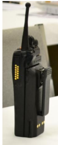
Do not use stubby antennas on portable radios